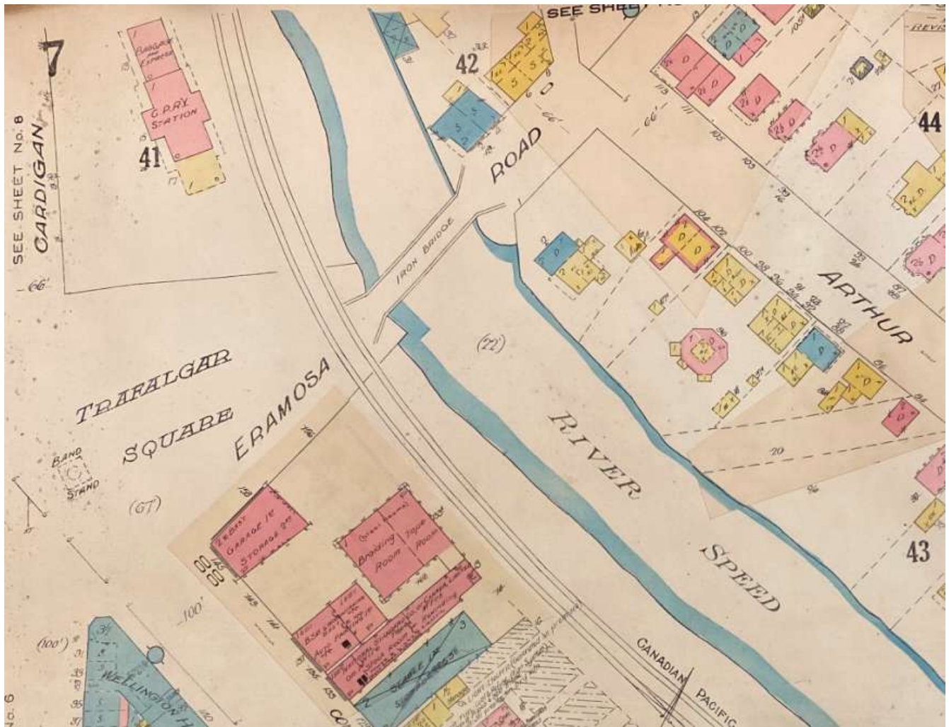
CPR Station, Underwriters Survey Bureau Fire Insurance Plan, March 1922, revised to October 1929