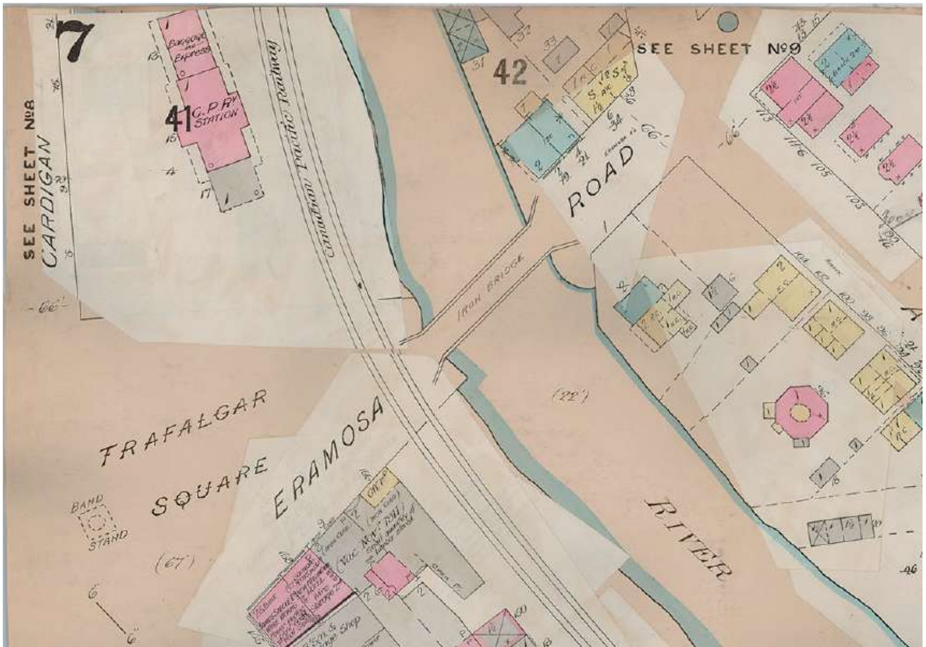
CPR Station, Charles E. Goad Fire Insurance Plan, November 1907, revised to November 1911