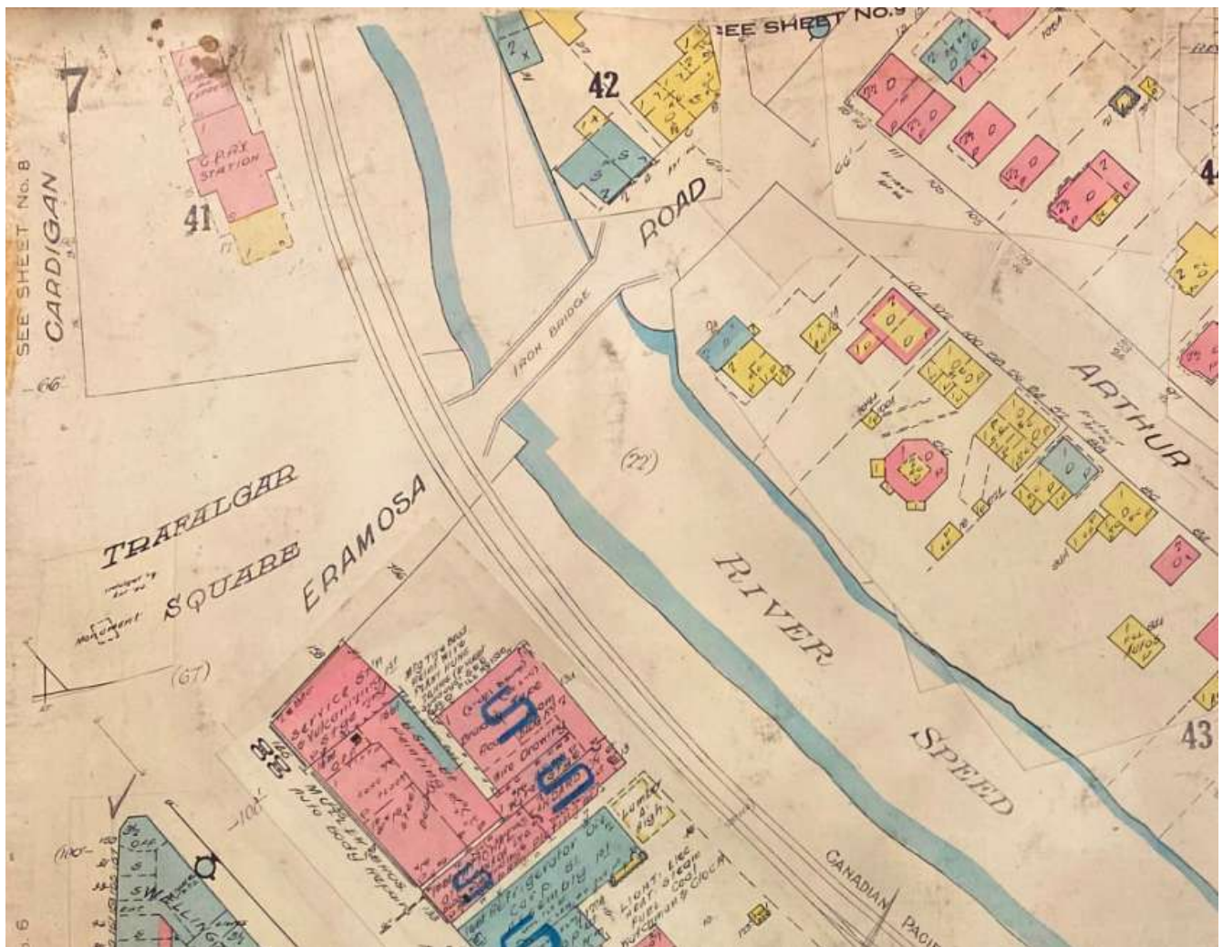
CPR Station, Underwriters Survey Bureau Fire Insurance Plan, March 1922, revised to April 1946